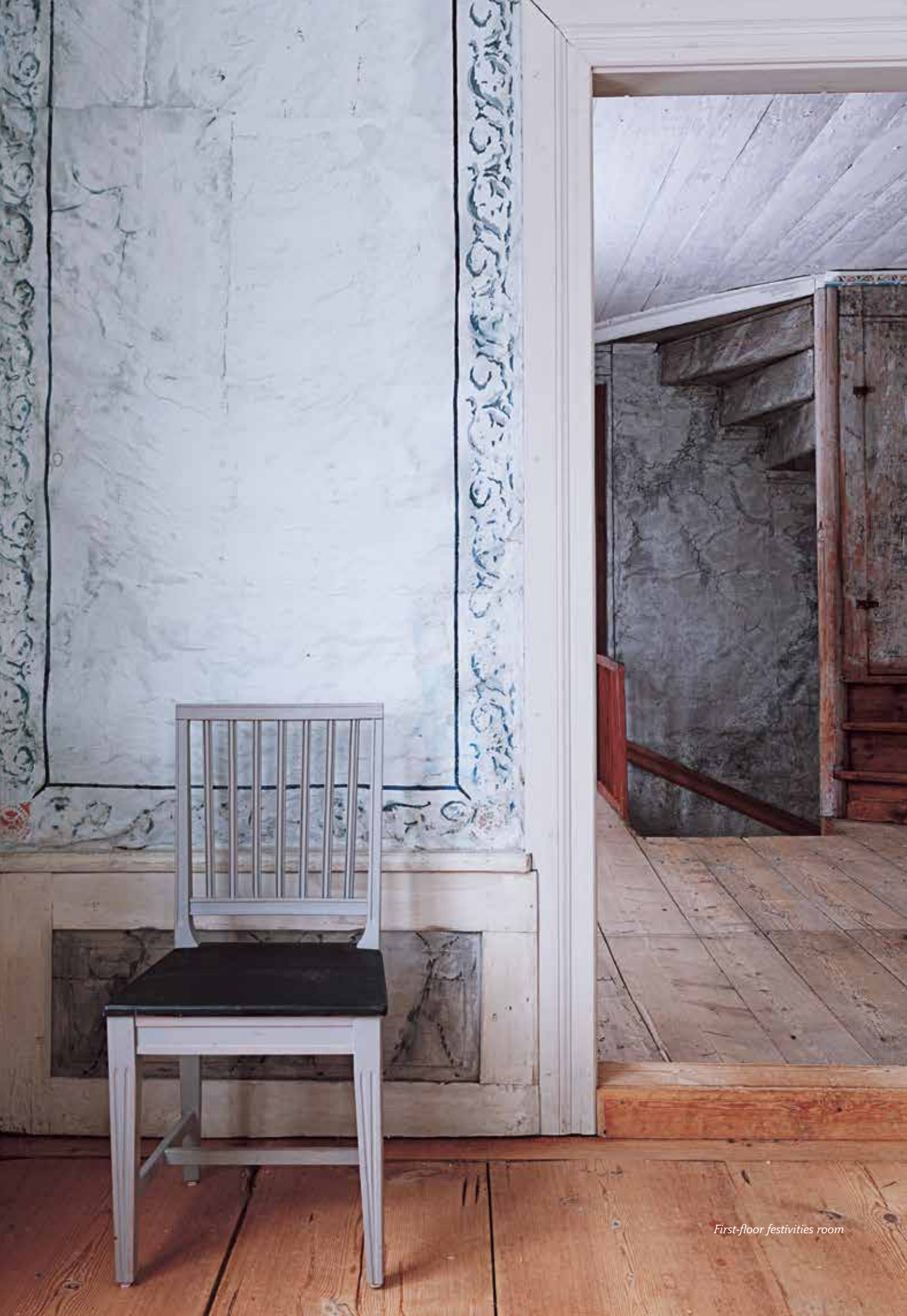
First-floor festivities room